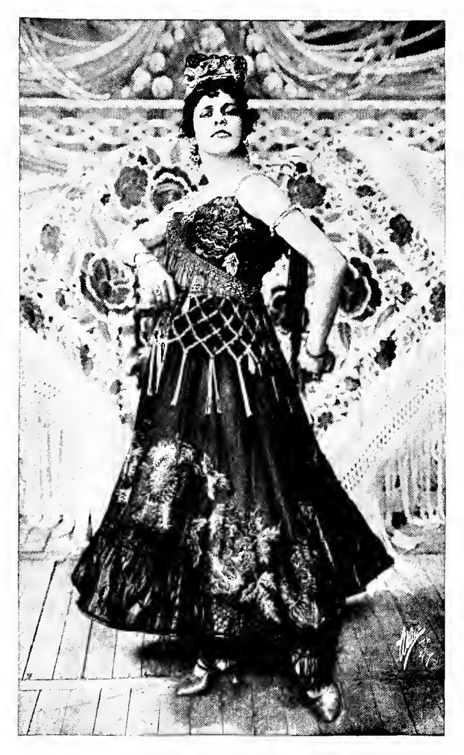
DOLORETES from a photograph by White